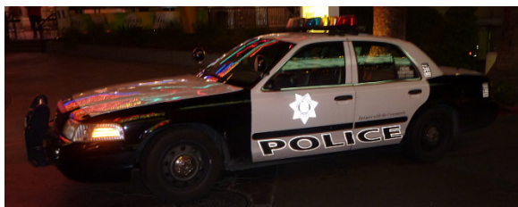
Las Vegas Metro Police Vehicle